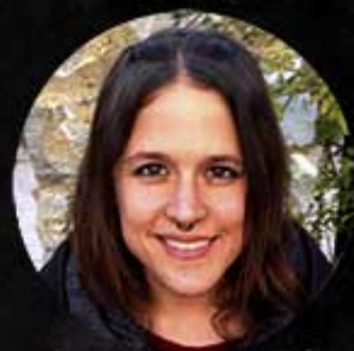
Almudena Oneto Lighting Design