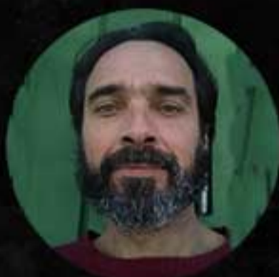
Carlos Monzón Scenography